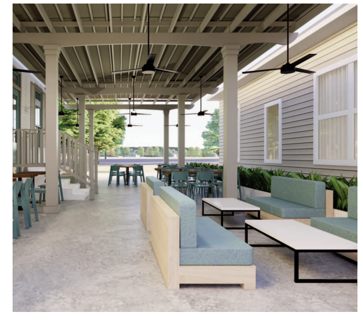
Tuk Tuk Boom will feature outdoor patio seating.

Puckett opened Tuk Tuk Boom in Highland Village about