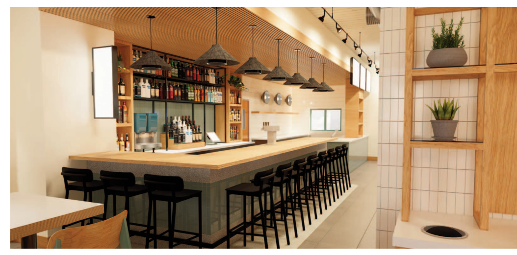
A rendering shows what the bar area of Tuk Tuk Boom will look like.