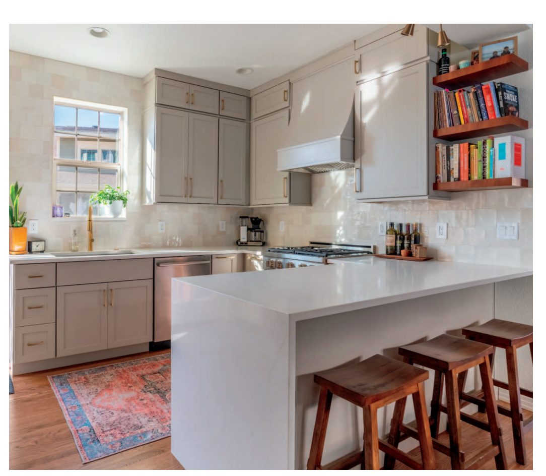
Refacing I Redooring I Custom Cabinets Original Tune-Up I Cabinet Painting

7601 Old Canton Road • Madison, Mississippi 39157 601.856.4455 • www.MRApats.org